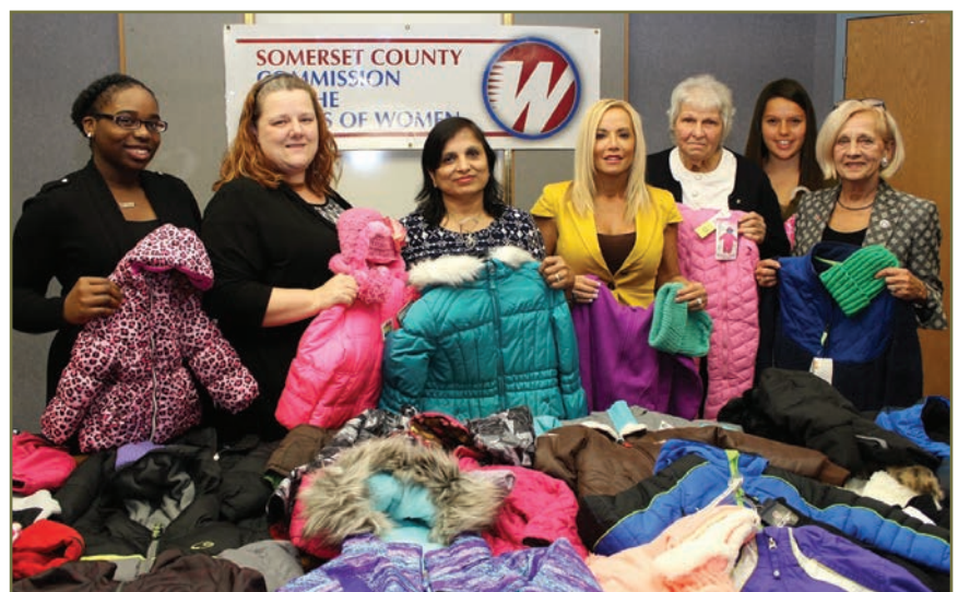
The Commission on the Status of Women collects hundreds of "Project Warm Your Heart" donations each year thanks to the public's generosity.

The annual "Adopt-A-Family" program, which provides the cost of a Thanksgiving dinner for needy families and individuals, will get underway next month. For a donation form, visit the county website at www.co.somerset.nj.us