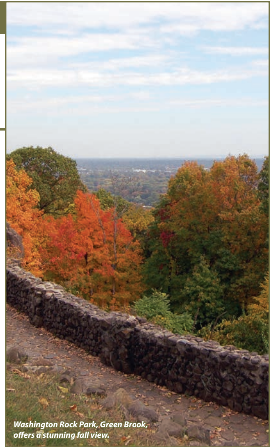
Washington Rock Park, Green Brook, offers a stunning fall view.

Since the program began in 2007, over 1.4 million pounds of materials have been dropped off for shredding by more than 19,000 residents, thereby keeping personal information out of the hands of unauthorized people who could potentially wreak financial havoc. In 2016, the number of cars increased by 560, for a total of 4,136, and the volume of paper shredded increased by close to 19,000 pounds, for a total of 231,303.