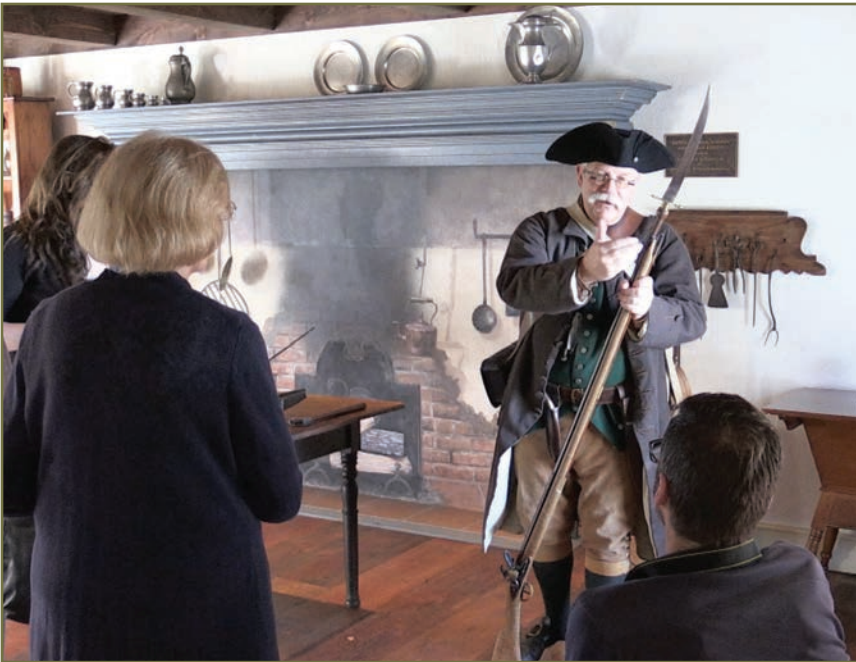
Revolutionary War re-enactors will be part of the Weekend Journey through the Past.