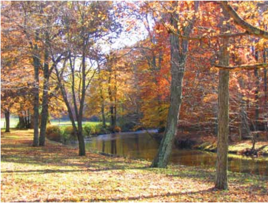
The North Branch of the Raritan River meanders through a scenic stretch at Natirar.