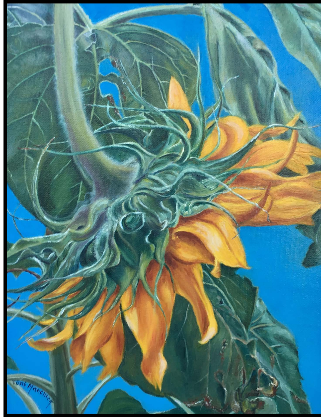
Sunflower by Toni Marchick

Venue: Cultural & Heritage Gallery at 20 Grove Street, Somerville, NJ 08876